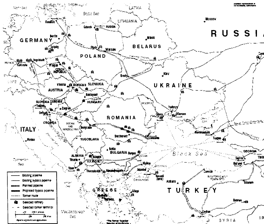
Figure 3: Proposed Black Sea Bypass Routes.

But this transformation of the Black Sea region has not been without a cost. Black Sea traffic has included illegal immigrants bound for Europe from countries well beyond the Black Sea region. Along with commercial cargo from the littoral states, Black Sea traffic has included weapons, military equipment and ammunition from Cold War-era depots and factories still producing hardware that few of the militaries in the region need or can afford to procure. Loose or even outright absent customs and border controls in many of the post-Soviet lands, including some unrecognized breakaway territories in the vicinity of the Black Sea, make it an ideal gateway to or from Europe and much of Asia for illegal arms merchants and smugglers of drugs, people and various other kinds of cargo commonly associated with globalization’s dark side. 10