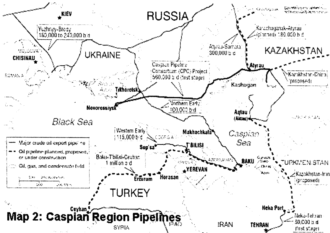
Map 2: Caspian Region Pipelines